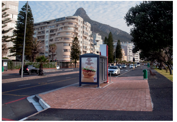
Route 113 expands MyCiTi's coverage in the Sea Point area.

MyCiTi services in the area will be complete when the route from the central city along Main Road to Hout Bay launches in 2014.